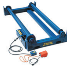
15 TON REEL ROLLER Part# 615