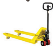
27" x 48" 6,600 LB CAPACITY PALLET JACK Part# PJ27