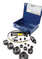
1/2-4" KNOCKOUT SET Part# 154PM