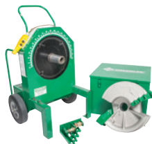
ELEC BENDER CLASSIC W RGD SHOE Part# 555RSC