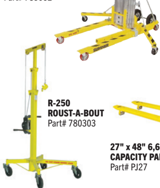
R-250 ROUST-A-BOUT Part# 780303