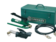
BENDER, HYD-COND (1-1/4X5) Part# 885