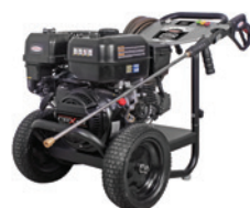
3000 PSI AT 3.0 GPM GX200 AAA® TRIPLEX PUMP COLD WATER GAS Part# IR61095