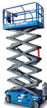
19-25' E-DRIVE, FOLDING RAILS, SWING GATE Part# GS-1932