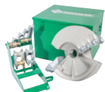
SHOE GROUP, EMT 1/2 - 2 Part# 23803