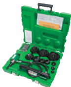
HAND PUMP HYD, SB, 1/2" - 4" Part# 7310SB