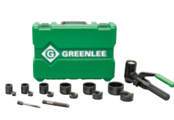
QUICK DRAW 90, SB, 1/2" - 2" Part# 7906SB