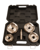
DIE, SET LARGE 2-1/2" - 4" Part# MP-03PRO