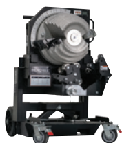
BENDER, POWER 2 IN (BENDS RIGID/EMT/IMC 1/2-2") Part# PB2000