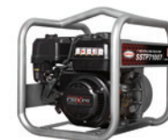
2" SEMI TRASH PUMP Part# 71007