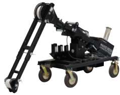
MAXIS XD10 EXTREME DUTY CABLE PULLER Part# XD10