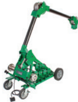
UT10 PULLER PACKAGE W/MVB + ADAPTERS Part# 6906A