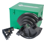
SHOE GROUP, PVC-CTD RGD 1/2-2 Part# 12586