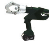
CRIMPER INDENT, 12T LI, 120V AC Part# EK12IDLX120