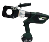
CUTTER WIRE, ACSR 55MM STD, 120V Part# ESG55LX11