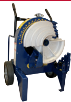
ELECTRIC BENDER FOR 1/2" - 2" CONDUIT Part# 77