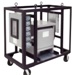
3-PHASE TRANSFORMER POWER STATION, 4 WHEELS, 480V 3P4W TO 120/208V 45PW, 15KVA TRANSFORMER Part# 6220PDC75