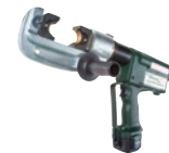
15 TON CRIMPER Part# EK1550