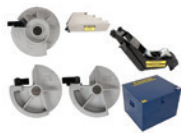
SHOE GROUP, 700 STYLE, RIGID 1/2" - 2" Part# 700R