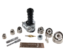
KIT, SET W/ DRIVE UNIT MPXD-SD 1/2-2" Part# MPXD-SD