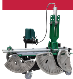
BENDER, HYD 881 W/ TBLE & PUMP Part# 881GXE980MBTS