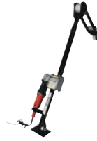
PULLER, CABLE M6K-M MAXIS 6K W/ MOTOR Part# M6K-M