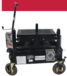
FEEDER, CABLE MAXIS MCF-01 Part# MCF 1