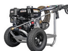
4400 PSI AT 4.0 GPM TRIPLEX PUMP GAS Part# IR61096