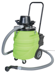
POWER FISHING SYSTEM (15' HOSE) Part# 690-15