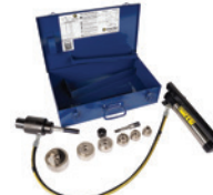
1/2-2" SS KNOCKOUT SET Part# 161SS