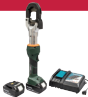
CUTTER WIRE, ACSR 45MM STD, 120V Part# ESG45LX11