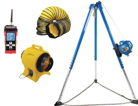
CONFINED SPACE KIT Part# Lonestar KIT