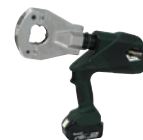
6 TON QUAD CRIMPER Part# EK6FTLX11