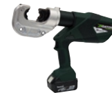
CRIMPER, 12T LI, STD, 120V Part# EK1240LX11